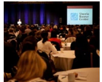
Top: Seth Mnookin, keynote speaker