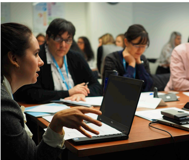
SBC workshop attendees (above).